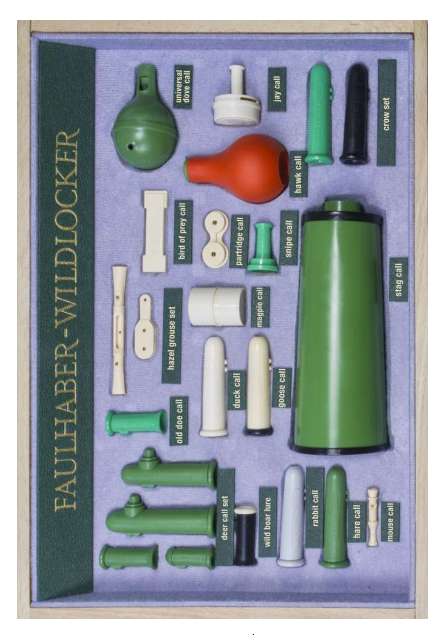
Page 8 of 8